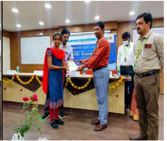
Glimpses of the prize distribution Ceremony on CSI Foundation Day