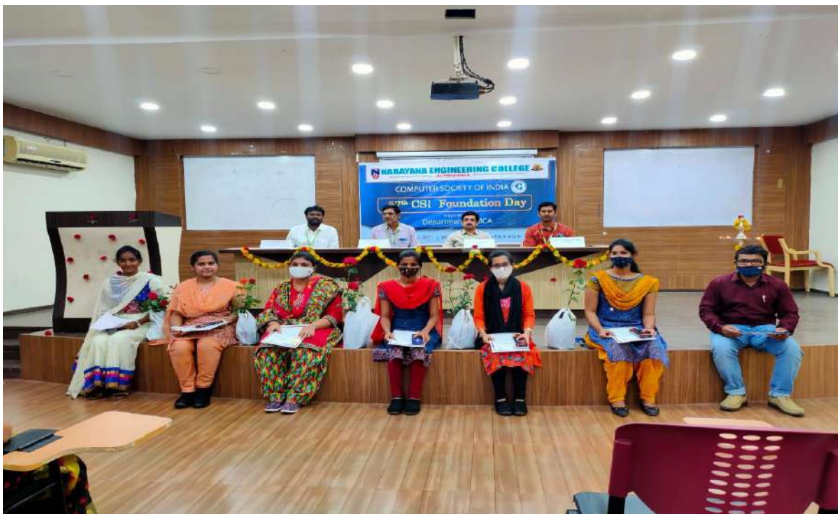
Winners and Runners of the Event-57 th CSI Foundation Day