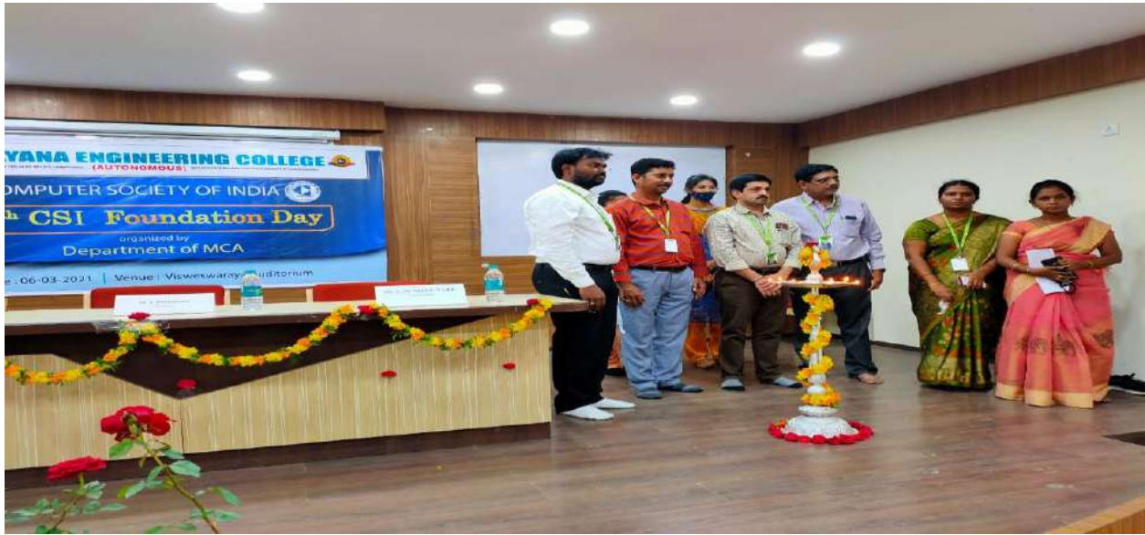
Inauguration of 57th CSI Foundation Day Event