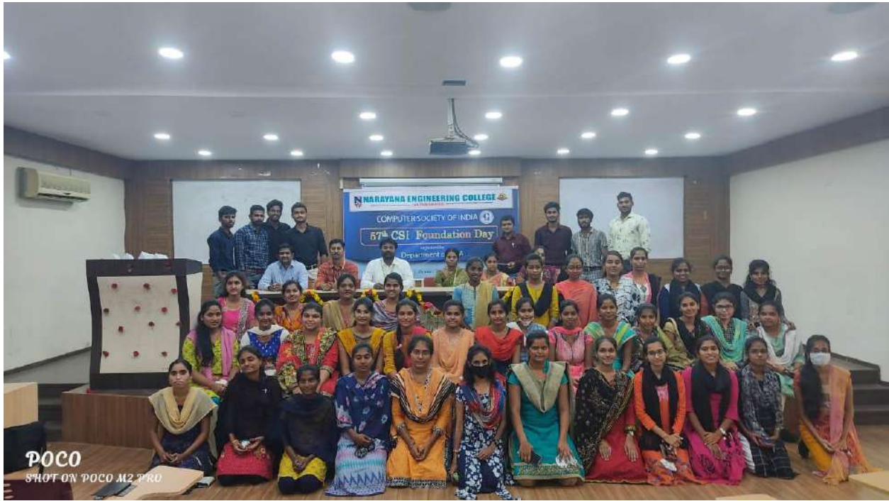
Participants of the Event-57 th CSI Foundation Day