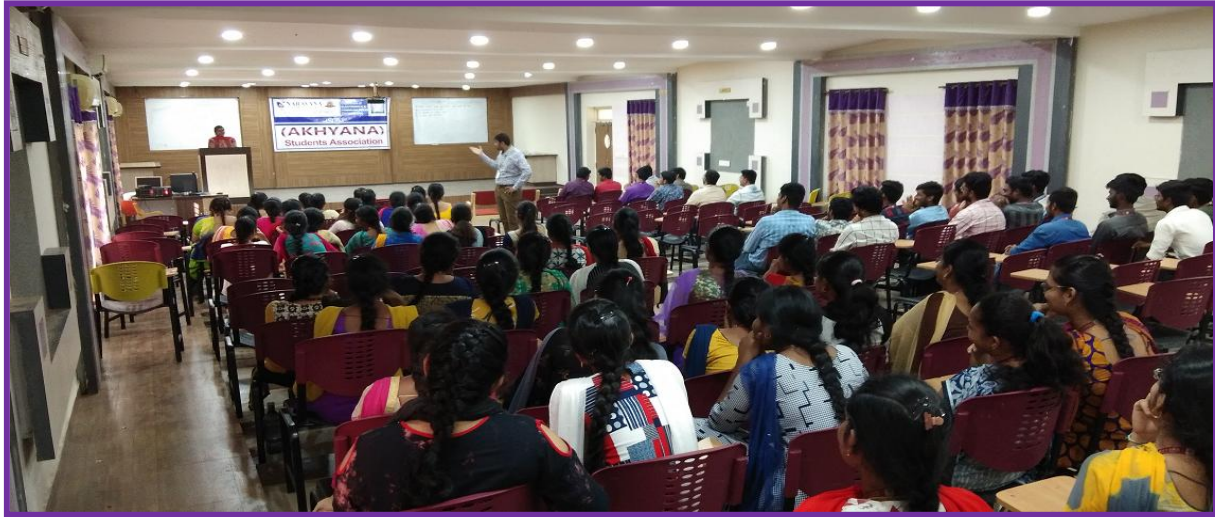
Fig: Active involvement of the students in JAM session.